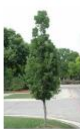
Regal Prince Oak