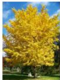
Autumn Gold Ginkgo