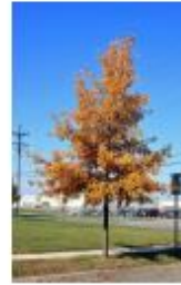
Swamp White Oak