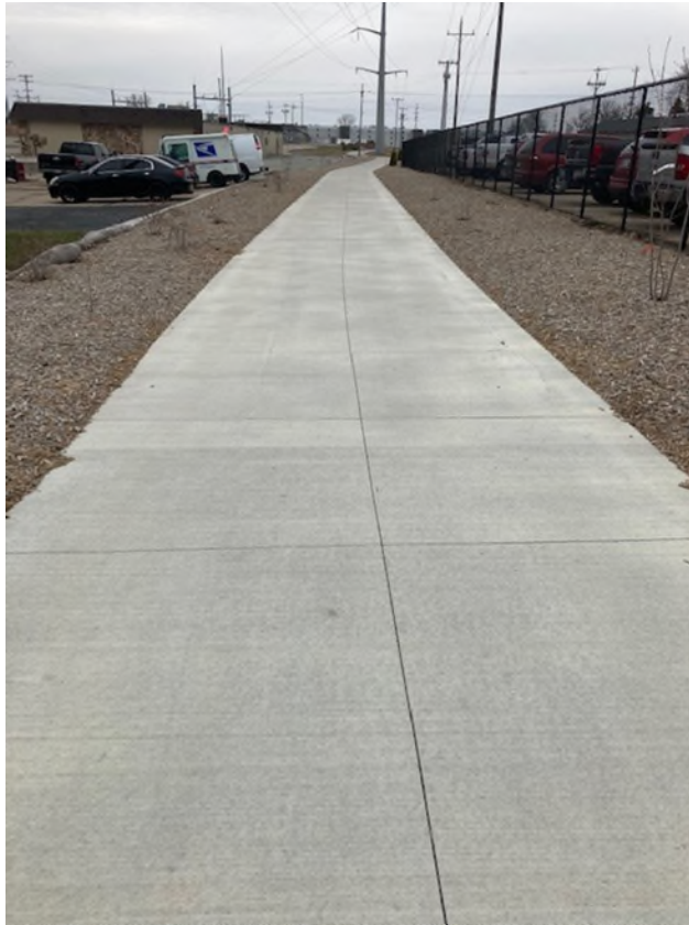
Concrete Pedestrian Trail – with sawed joints