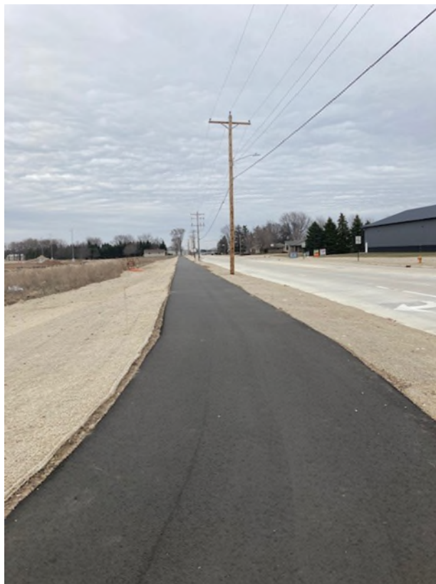
Asphalt Pedestrian Trail