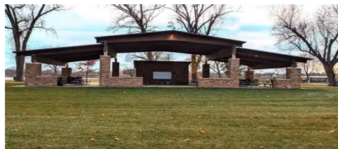
Doyle Park Cheese Fest Shelter