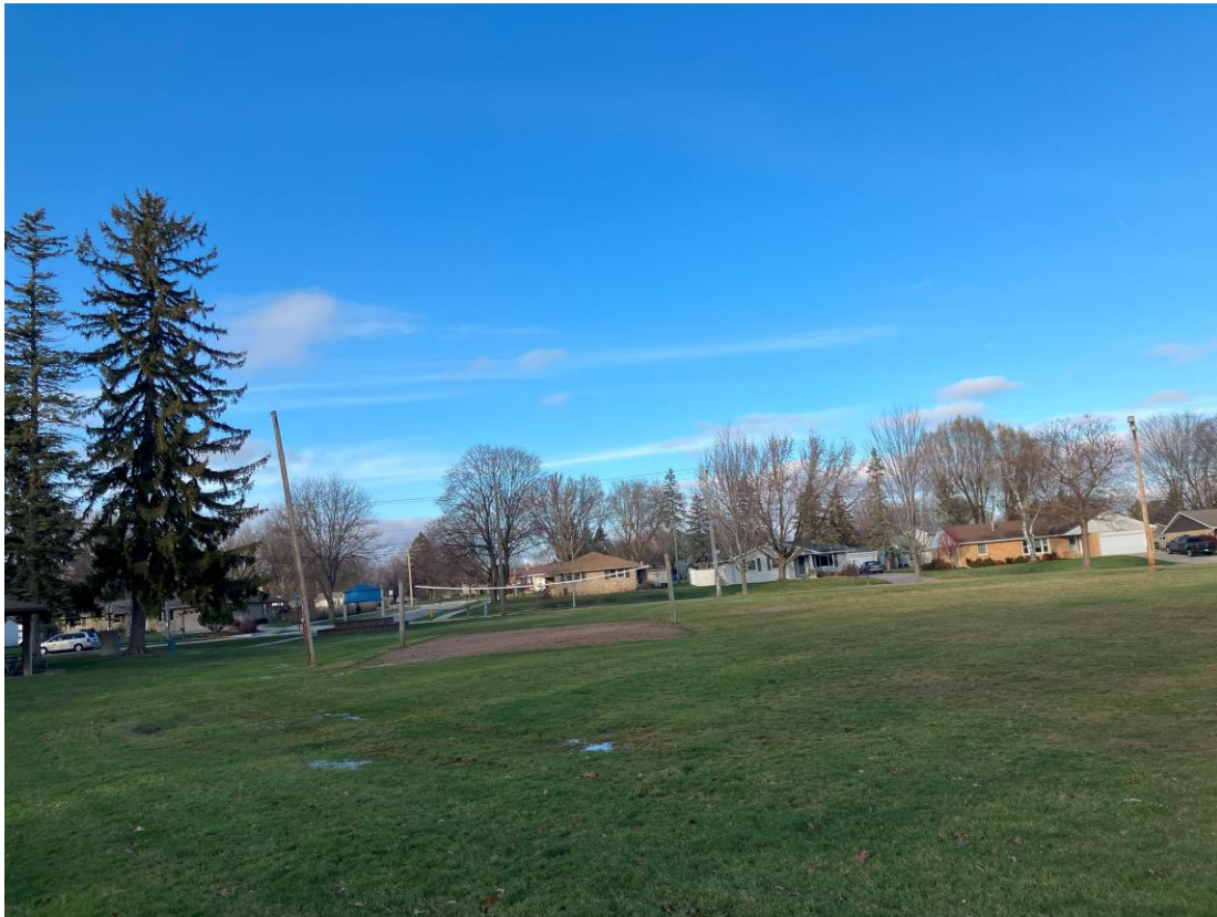
Restroom to Street View